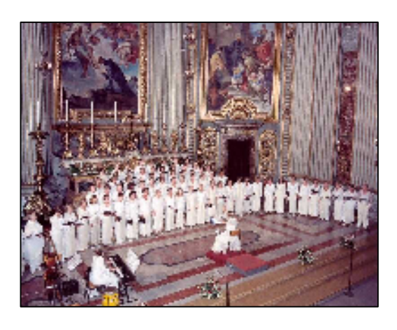
SATURDAY JULY 29<sup>th</sup>, 2006 9:00 pm

CHIESA DI S. IGNAZIO PIAZZA S. IGNAZIO - ROMA