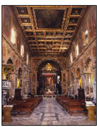
Opening Concert of the II International Sacred Music Choir Festival

9.00 PM Church S. Lorenzo in Lucina, Piazza S. Lorenzo in Lucina